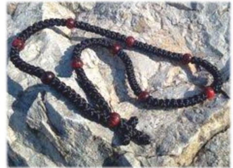
Pater Noster Cord

Through the centuries, saints like St. Dominic, St Catherine of Siena and Pope St. John Paul II, as well as countless ordinary Christians have found the Rosary to be a school of prayer and a source of spiritual blessing. It is both simple and profound: the rhythmic repetition of the words brings peace to the soul, and uplifts the mind to God."